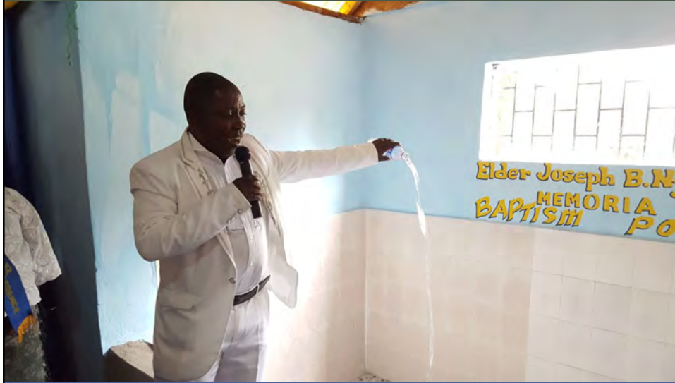
Dedicating the Baptismal Tank