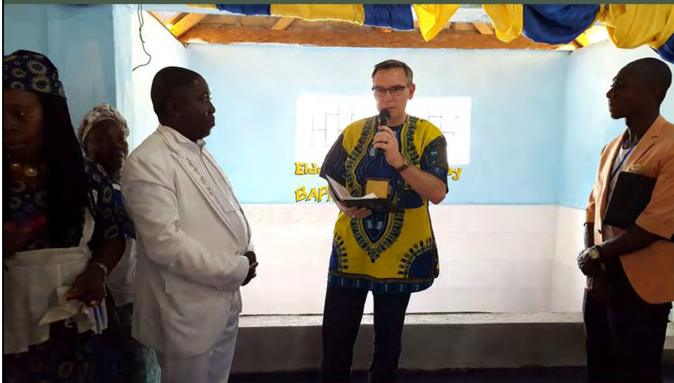
Dedicating the Baptismal Tank