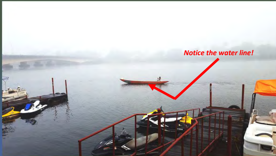
Returning for another load!