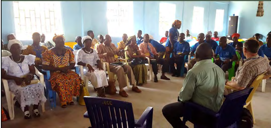
Getting updates from Leadership Training & Bassa Literacy Programs