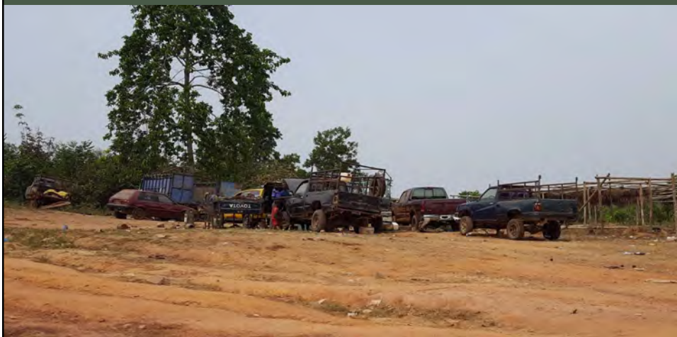
Mechanics at work