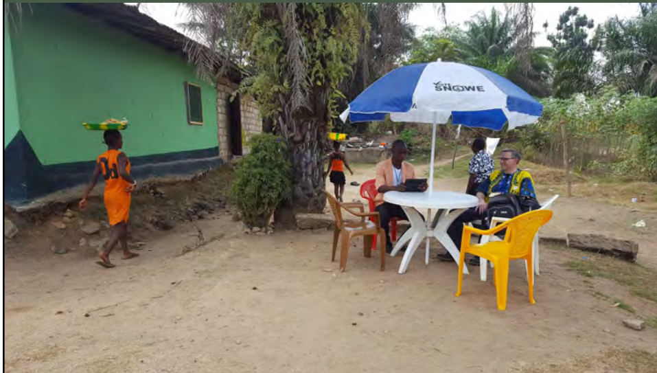
The "VIP" Lounge!