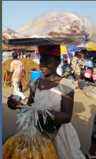
Selling Plantain Chips