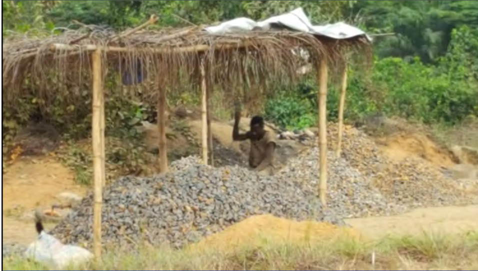
Making Gravel with Hammers