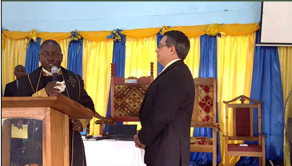
Giving of an African Name: "Mana" ( Blessing )