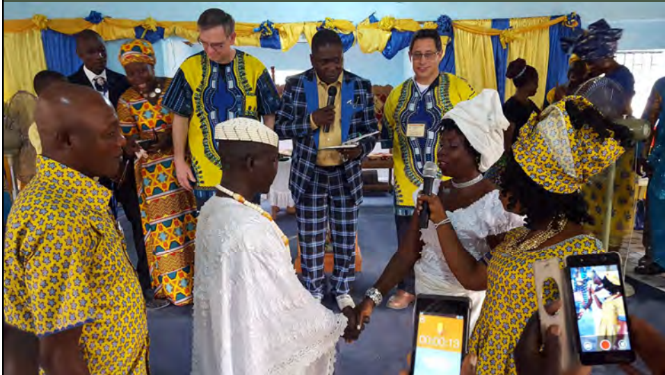
Officiating a “Christian” Marriage (w/ rings!)