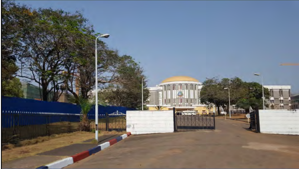
Liberia's Capital Building