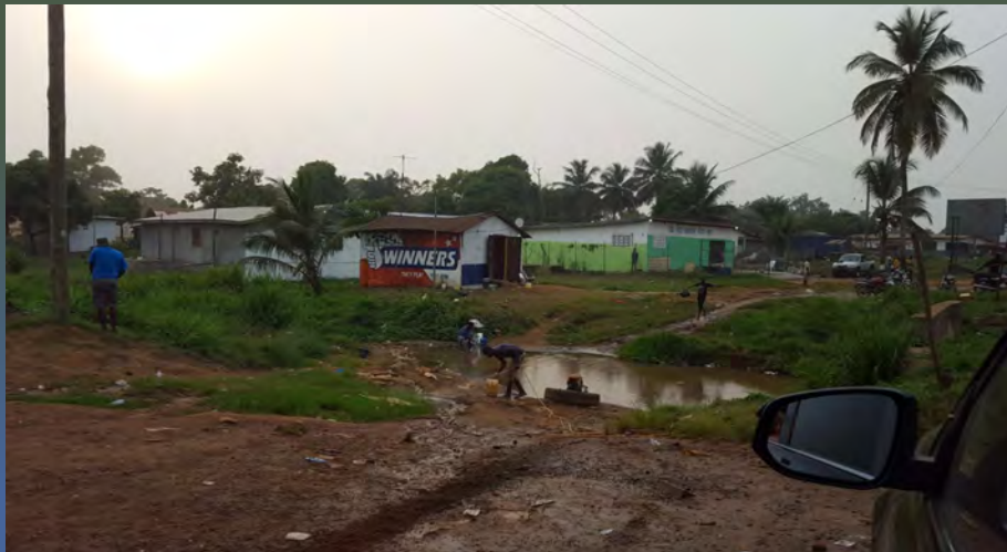
Car washes frequently pop up wherever water can be found