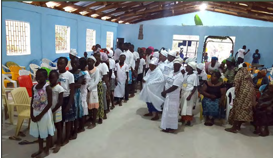
26 Baptism Candidates!