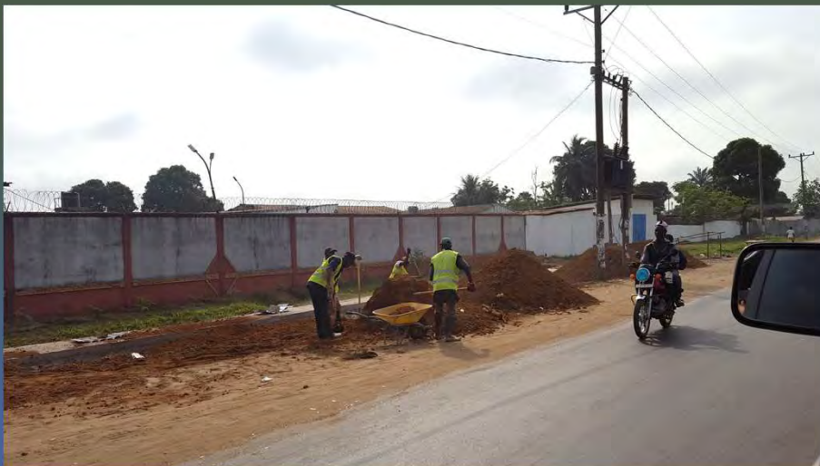
Manual road construction