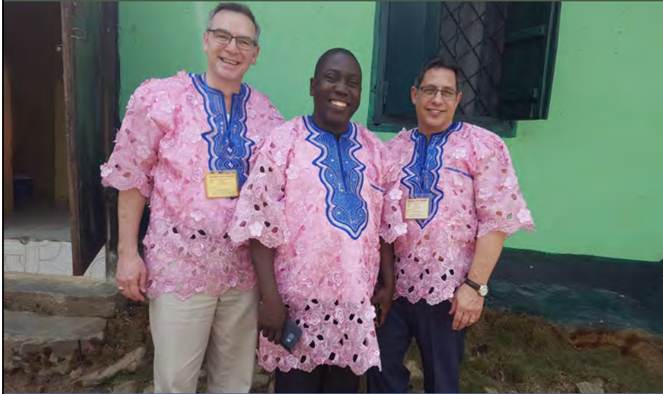
The Things You Do For Love! 😊