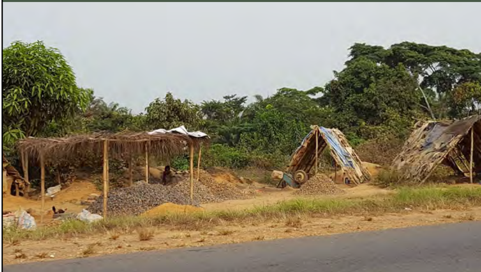
Making Gravel with Hammers