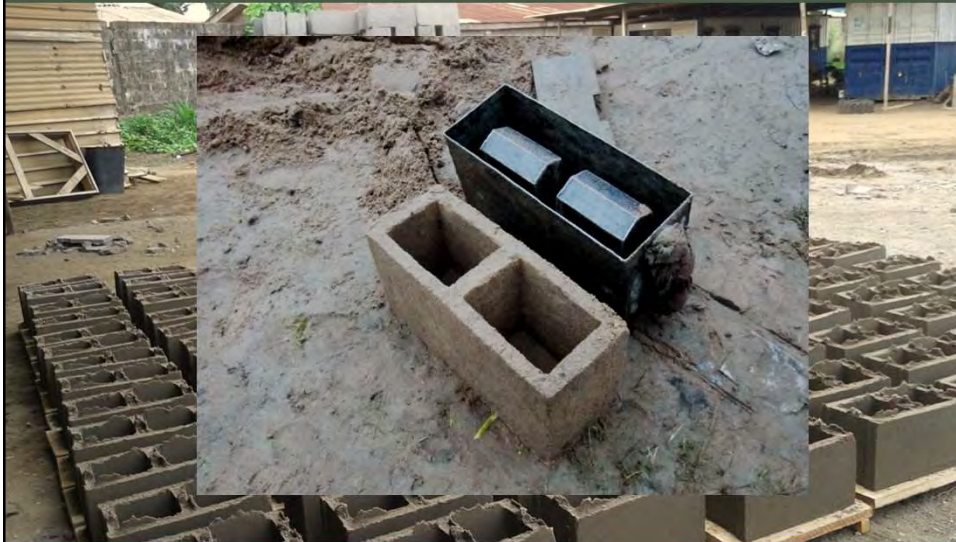
Cinder Blocks Made Manually