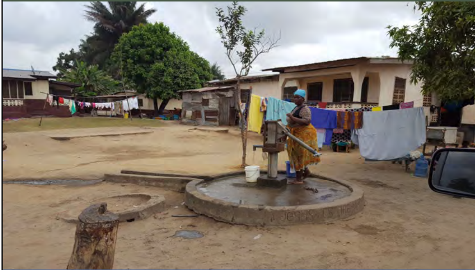
Village Water Pump